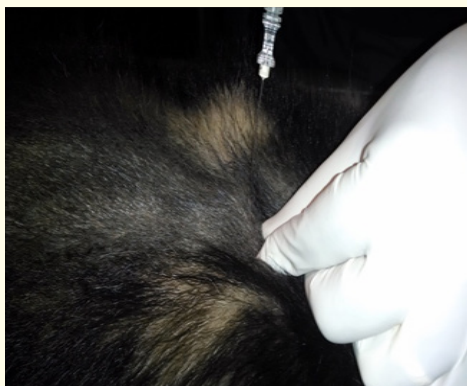
Figure 3: Application of prolotherapy injections with disposable spinal needle.

It says the owner of the treatment options that exist today, as is prolotherapy and including conservative therapy consisting of use or administration of anti-inflammatory steroid type. However and despite the anti-inflammatory properties of glucocorticoids have been well recognized since the 1960s, current work has not been demonstrated successfully in patients with spinal diseases putting a shadow of doubts about its real utility [9]. The treatment plan of regenerative medicine which consisted of five applications using an irritating solution, a local anesthetic and a vehicle application (50% glucose, saline and lidocaine) is established. Channeled with 0.9% NaCl and sedation protocol was applied in order to immobilize the patient during the procedure, was performed trichotomy and antisepsis ranging from the first thoracic vertebra to the iliac sacrum portion, using a spinal needle 22 gauge proceeded to apply the Remedy in every facet joint the amount of 2 ml per injection (Figure 3, 4). It was applied at the end of each tramadol session at 4 mg per kg avoiding any anti-inflammatory drugs of any kind because these have an adverse effect on the process of inflammation of the tissues [10] and compresses applied local heat with hot water bags in order to increase the flow of solutions subsequent to treatment (Figure 5).