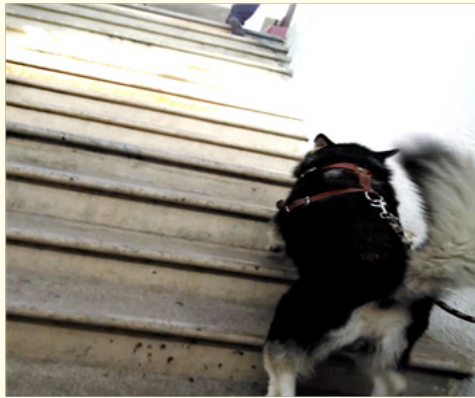
Figure 7: The patient performing movements up and climbing stairs is appreciated.