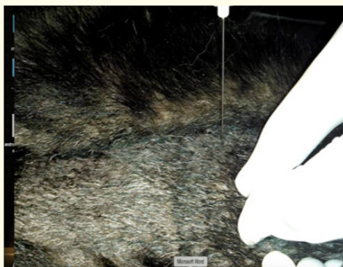
Figure 4: Application of prolotherapy injections with disposable spinal needle.