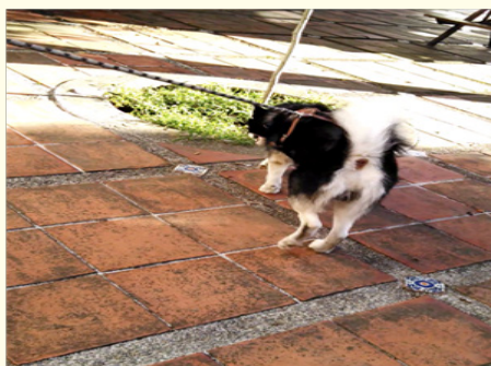
Figure 6: The patient performing movements up and climbing stairs is appreciated.

From the first application the second session was scheduled 15 days after observing marked improvement, because the dog could move in a better way, he had even slight signs of ataxia hemi lateral but could be incorporated without restrictions. Then a month later was quoted, in which overall patient improvement was observed, so neurological examination was performed again without finding alterations in any phase of the study (Figure 6, 7). The owner it was recommended two sessions with a range of thirty days between sessions to further promote the strengthening of the yellow ligaments.