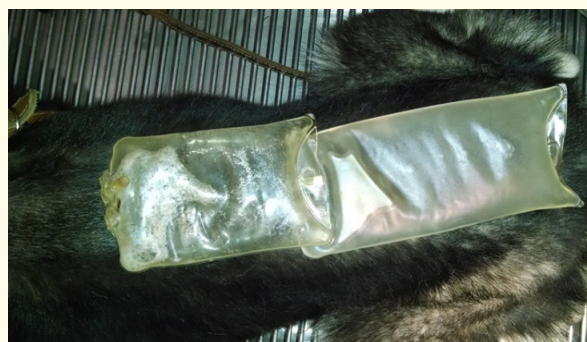
Figure 5: Application of local heat compresses using hot water bottles.

From the first application the second session was scheduled 15 days after observing marked improvement, because the dog could move in a better way, he had even slight signs of ataxia hemi lateral but could be incorporated without restrictions. Then a month later was quoted, in which overall patient improvement was observed, so neurological examination was performed again without finding alterations in any phase of the study (Figure 6, 7). The owner it was recommended two sessions with a range of thirty days between sessions to further promote the strengthening of the yellow ligaments.