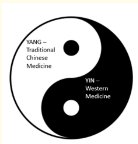
Figure 4: Yin and Yang metaphor of traditional Chinese medicine and Western medicine.

To understand all the alterations that could be happening in the patients with SARS-CoV-2 infection that have ground glass opacity in the CT of the Lungs, we need to understand the alterations that could be happening in the energy level that is causing the symptoms and alterations in the patients. So, we need to integrate the reasoning used by Western medicine and, by traditional Chinese medicine as you can see in the figure 4, to understand better what could be happening in these patients that are having ground glass opacity in patients with SARS-CoV-2 infections treatment [19].