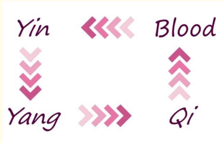
Figure 3: Yin, Yang, Qi and Blood.

In this schematic relationship between Yin , Yang , Qi and Blood , I am showing the necessity of having these four energy in balance state to maintain our health, because the energy that is maintaining the blood flowing inside the Blood vessels are Yin , Yang and Qi , but as I showed in the article written by me (2021) entitled Energy Alterations and Chakras' Energy Deficiencies and Propensity to SARS-CoV-2 Infection , and in the case reported in this article, to the Blood circulate adequately in all organs and systems without stagnating in any part of the body, it is necessary to have Qi and Yin and Yang energy. And in this case reported in this article, all her internal massive organs were in the lowest level of energy, meaning that the energy to produce Yin and Yang (Kidney or second chakra) was weak, the energy to produce Blood (Spleen or fifth chakra) was weak also, and the energy to produce Qi (Liver or first chakra and Lung or fourth chakra) was also weak. The distribution of energy in the entire body was compromised before the infection and was worsened with the type of medication used to treat all her clinical manifestations (highly concentrated medications) [9,13].