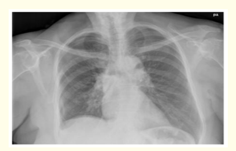
Figure 1: Decreased volume of Right hemithorax.

Blood workup was abnormal for normocytic anemia with a hemoglobin 10.9, low albumin of 2.8, and a sedimentation rate of 47. Other blood tests including other aspects of complete blood count, complete metabolic panel, coagulation profile, procalcitonin, blood and sputum cultures were all within normal range. Her chest x ray showed decreased volume of right hemithorax relative to left (Figure 1), with lateral view significant for mid thoracic posterior opacity (Figure 2).