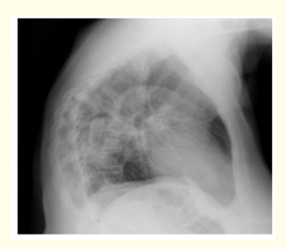
Figure 2: Mid-thoracic posterior opacity.