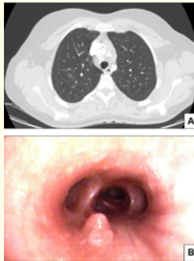
Figure 1: Radiological features of mediastinal mass.

A 37-year-old woman with no medical history of interest, followed up for suspicion of sarcoidosis since 2015, due to the chance finding of bilateral mediastinal adenopathies on a preoperative chest RX for knee surgery. To complete the study, a chest CT was performed showing multiple mediastinal, paratracheal, subcarinal and bilateral hilar adenopathies (Figure 1A and 1B). An echocardiogram and a spirometry were performed, showing normal parameters. In February 2018, an EBUS-TBNA was performed for the study of lymph nodes (Figure 1C). Cytology samples showed mature lymphocytes and abundant bronchial cells without atypia, associated to histocytes and multinucleated giant cells. Absence of granulomas and of necrosis was observed. Histochemical staining for Mycobacterium tuberculosis resulted negative. Together with the clinical features of the patient, the diagnosis was suggestive of sarcoidosis, without ruling out other possibilities (Figure 2). There was no complication, nor fever, nor pain after the EBUS. Prednisone 50 mg/day was began.