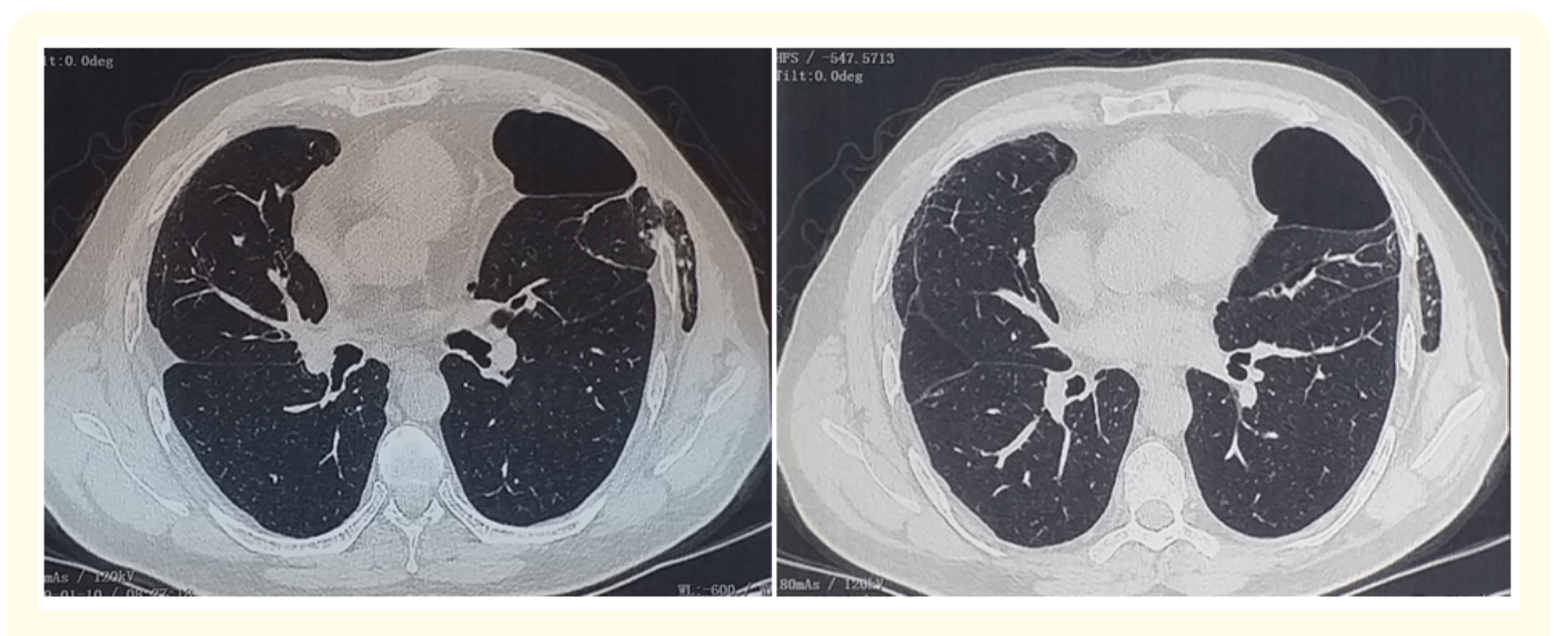
Figure 4: Computed tomography scan: intercostal lung hernia.