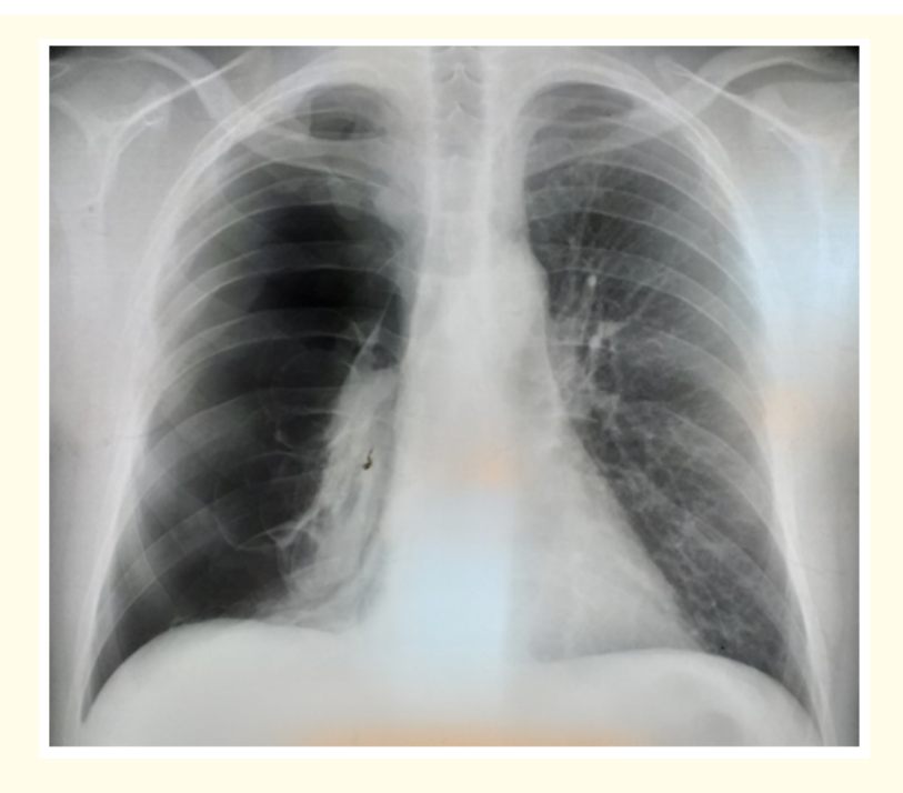
Figure 2: Total right pneumothorax.