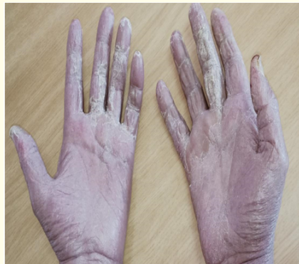
Figure 2: Erythematous eruption and squamous Palmar (reported cases).

The evolution to one month of treatment was marked by a generalized rash with Erythroderma (Figure 2) and fever at 39°C. The biological balance showed hypereosinophilia at 1550/mm 3 with an increase of the ASAT to 110 IU and the ALAT to 126 IU, which was in favor of a DRESS syndrome.