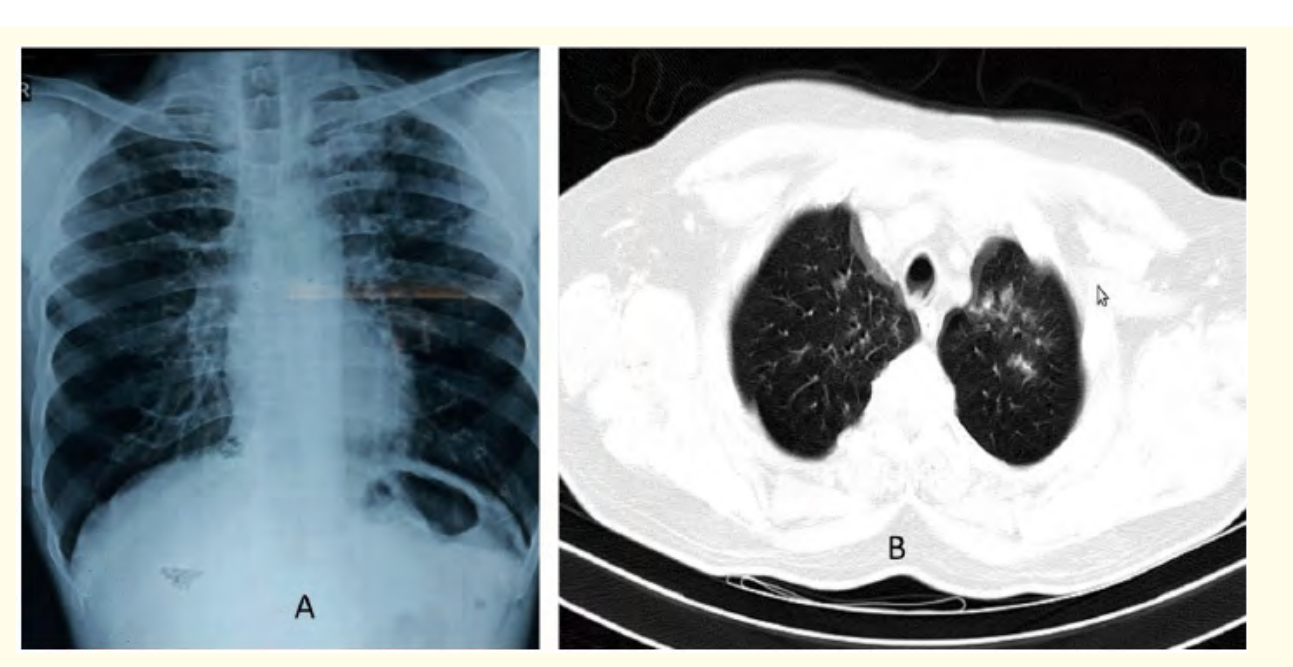
Figure 1: 1A: X-Ray chest PA showing non-homogenous infiltrate in the left upper zone. 1B: HRCT Thorax showing nodular lesions, tree in bud lesions in left upper lobe.

Routine blood investigations were within normal limits except for a raised erythrocyte sedimentation rate of 80 mm/lst Hour and haemoglobin value of 10 gm/L. Sputum examination for Acid Fast Bacilli (AFB)was negative in two consecutive samples. Sputum routine culture showed growth of Klebsiella pneumoniae. He was started on broad spectrum antibiotics and other supportive measures. Because of haemoptysis he was subjected to fibreoptic bronchoscopy for further evaluation of tracheobronchial tree. Vocal cords and trachea were normal. In the left main bronchus at its division and in the left upper lobe bronchus there were multiple mucosal ulcers (Figure 2A and 2B), base of which was filled with cheesy necrotic material. Bronchial washing was taken for routine culture and sensitivity, AFB smear and Cartridge Based Nucleic Acid Amplification Test (CBNAAT). Biopsy was attempted from the ulcer which induced fresh bleeding. Gram staining and culture were negative. Bronchial washing on AFB staining showed acid fast bacilli. Rifampicin sensitive mycobacterium tuberculosis (MTB) was detected on CBNAAT. He was put on Category-1 anti-tuberculous treatment (ATT) as per revised national tuberculosis control program (RNTCP) guidelines. Follow up at the end of intensive phase showed clinical improvement and final assessment is scheduled at the end of chemotherapy.