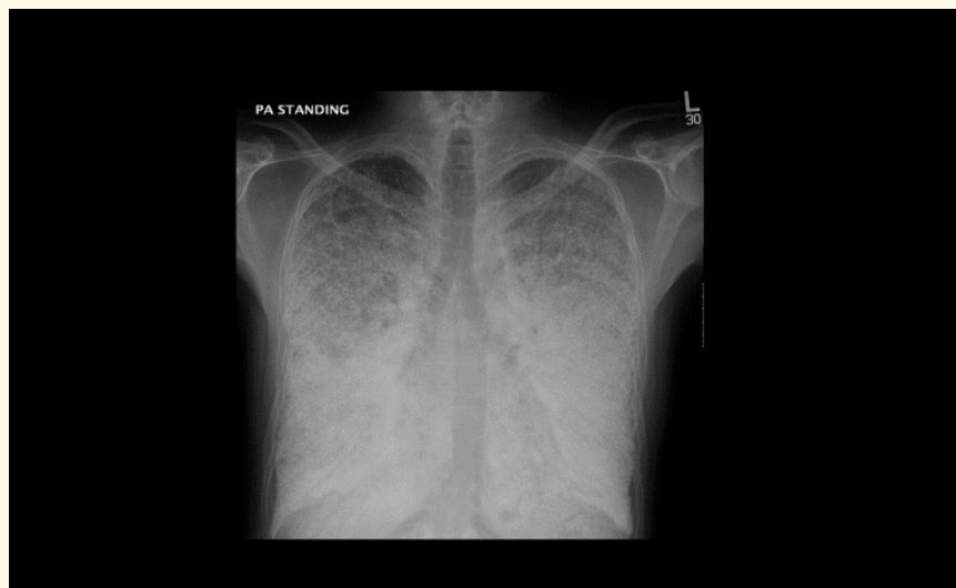
Figure 1: A PA CXR in PAM, shows sand-like calcification distributed throughout the lungs with bilateral distribution with middle to lower zone predilection subtle black pleural lines are seen.

Palombini BC, da Silva Porto N, Wallau CU, et al. advocated supplemental oxygen therapy in patients that were hypoxemic with rest, exercise or sleep. The authors also recommended that patients with PAM be vaccinated against pneumococcal and influenza [35].