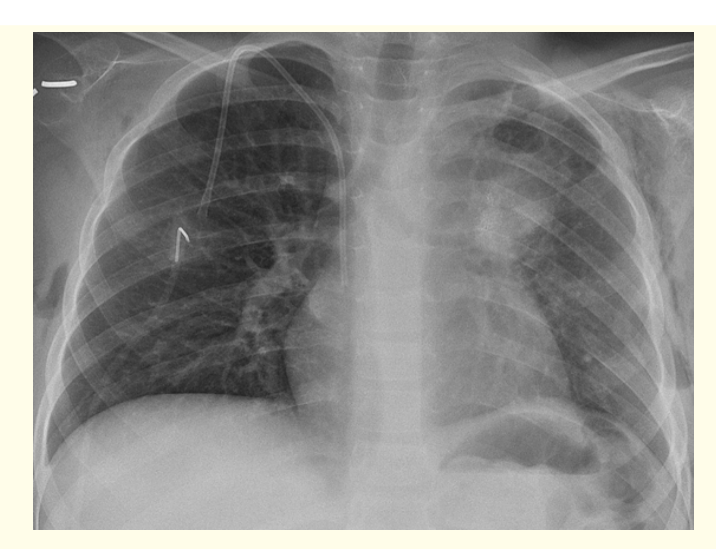
Figure 4: Chest x-ray after removal of the chest drain on the second postoperative day.

The chest drain was removed on the 2<sup>nd</sup> postoperative day with the chest x-ray showing a well expanded left lung after resection (Figure 4) and the patient was discharged on postoperative day 3 without any postoperative complications.