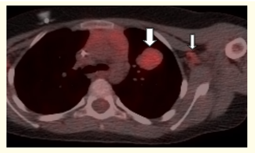
Figure 1: PET-CT showing tumor mass in the left upper lobe (thick arrow) and a suspicious lymph node in the left axilla (thin arrow).