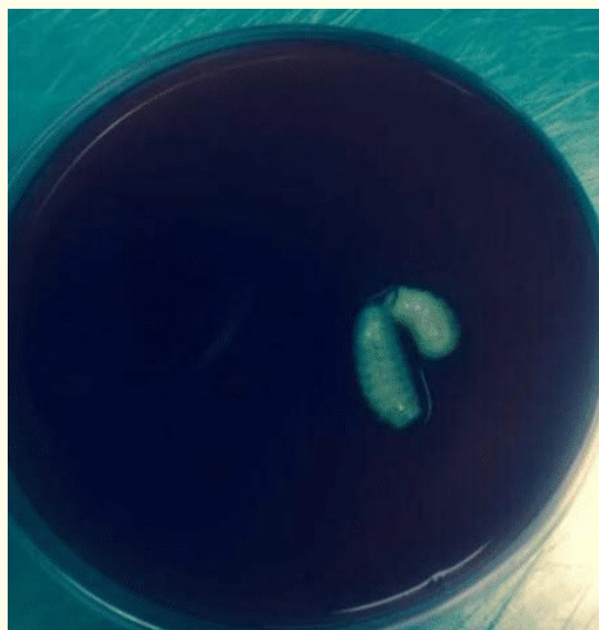
Figure 2: Stage three O. ovis larvae removed from the maxillary sinuses during endoscopic sinus surgery.