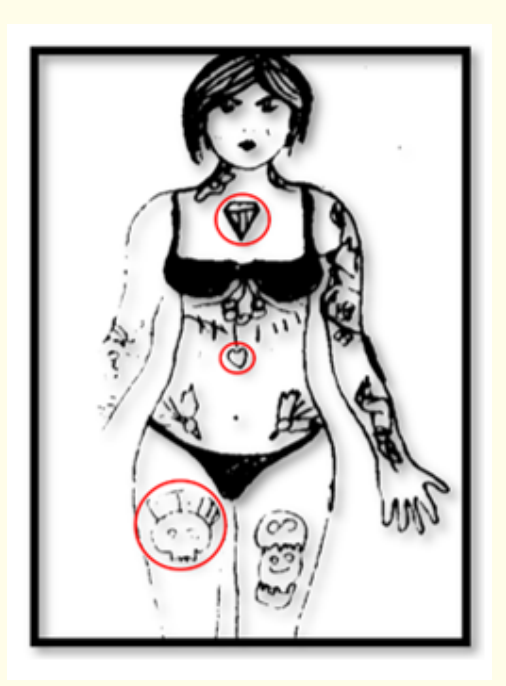
Figure 1: Representation of the "Symbols" tattoo category.

Regarding topic (2) of the questionnaire related to the "Tattoo Description", most tattooed designs referred to the "Symbols" category, representing 43.6% of the analyzed sample. This category included symbolic elements, such as heart, infinite, diamond, star, moon or skull.