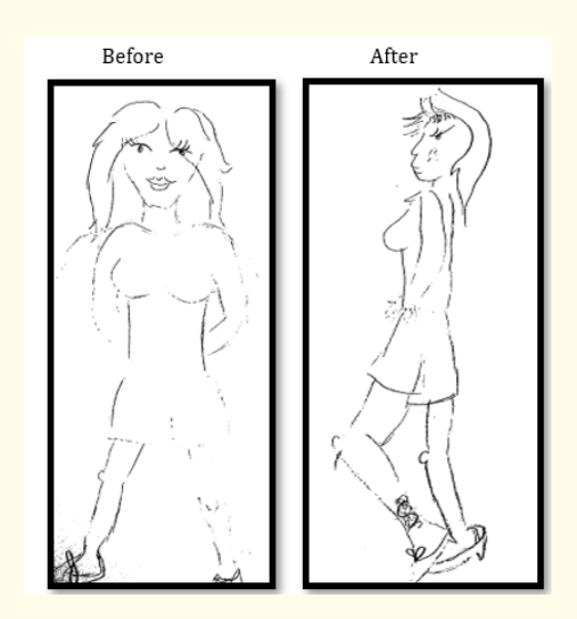
Figures 5 and 6: Representation of tattoos as an identity booster (body posture before and after being tattooed- the latter suggesting differentiation and identity).