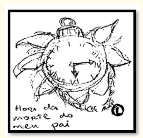
Figure 3: Representation the of the "Traumatic Memories / Loss" tattoo category (e.g. tattoo with the caption "my father's death hour").

The "Values/Spirituality" category represented 23.45% of the total sample. This category is associated with values, beliefs and concepts with mystical and spiritual meaning. Other mentioned categories were "Traumatic Memories/Loss" and "Significant Events" that represent 6.3% and 6% respectively of the total sample. The category "Traumatic Memories/Loss" is related to the experience of negative situations whereas the category "Significant Events" is related to the experience of positive situations.