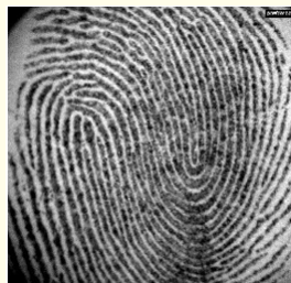
Figure 7: Clockwise/vertical.