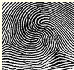
Figure 15: (9) Counterclockwise.

Yin and Yang double loop whorl formation types