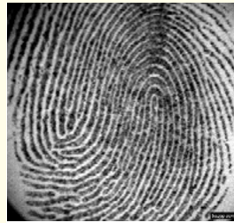
Figure 6: Counterclockwise/vertical.

The noted Yin/Yang displays (Figures 4 and 5) are the extreme opposite of each other. Most rear in the series (Do they actually exist?)