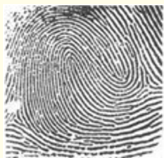
Figure 14: (2) Clockwise.

constitute different mindsets. A study on the frequency of double loop whorls with all ten digits will provide the answer to the question: Is there a correlation between the various human attributes and the friction ridge formations? Only then, will we be able to tell the true meaning of the pattern.