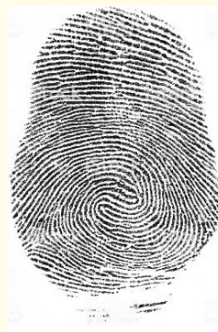
Figure 8: Clockwise/horizontal (Low Display).