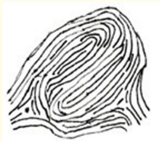
Figure 4: Clockwise/diagonal left (not found).