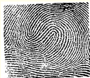
Figure 3: Counterclockwise/diagonal left.