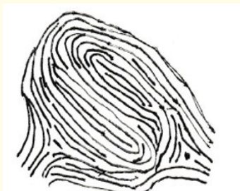
Figure 5: Counterclockwise/diagonal right (not found).