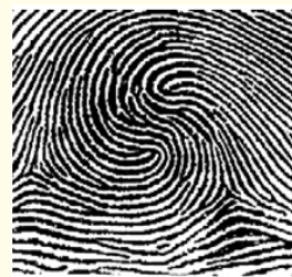
Figure 9: Counter Clockwise/horizontal (With enclosure above center).