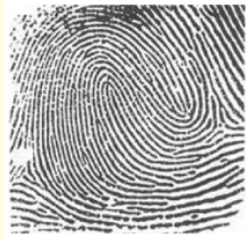
Figure 2: Clockwise/diagonal right.