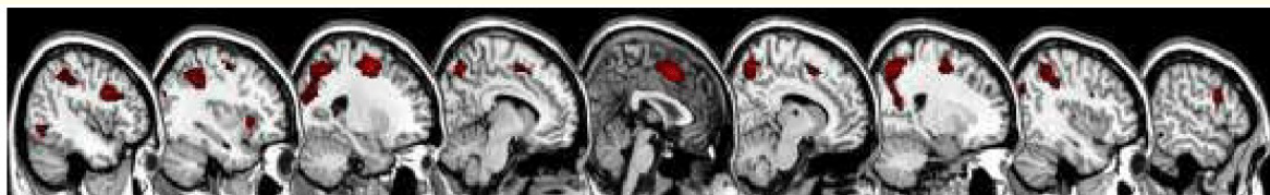
Figure 3: Sagittal presentation of common activations related to spatial processing across different domains. The figure shows activations mainly in dorsal Fronto- Parietal and in the Supplementary motor area (SMA).