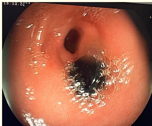
Figure 2: Endoscopic view of foreign objects at prepyloric region of the stomach.