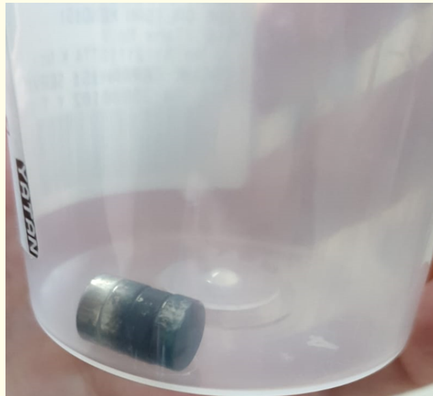
Figure 4: Magnets after removal.