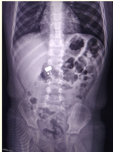
Figure 1: Abdominal radiograph showing metal objects in the abdomen, just right of the midline (Arrow: foreign object).

right of the midline (Figure 1). Repeat x-rays revealed the foreign bodies remained in the same position with no migration. Endoscopic removal of the magnets was planned. Upper gastrointestinal endoscopy was performed under general anesthesia and revealed multiple foreign objects located at prepyloric region of the stomach and the surrounding mucosa was eroded and hyperemic (Figure 2). Endoscopic removal of the foreign bodies was given a try but was not possible and a decision for explorative laparotomy was taken. At laparotomy, there were multiple magnets located at the prepyloric region of the stomach and second part of the duodenum attracting each other with the entrapment of bowel wall in between magnet pieces. After detachment of magnet pieces, perforations at prepyloric region and second part of the duodenum were detected (Figure 3). The magnets were removed and the perforation sites were repaired primarily (Figure 4). Postoperative period was uneventful and he was discharged on day 7.