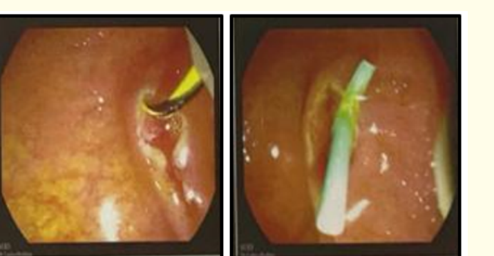
Figure 3: Sphincterotomy and implantation of the plastic pancreatic catheter.