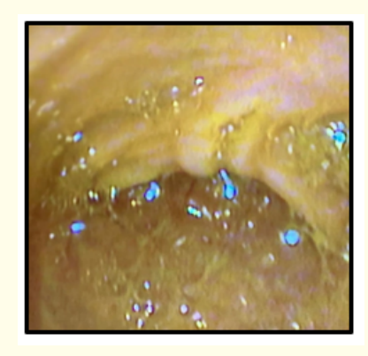
Figure 1: Esophagogastroduodenoscopy.