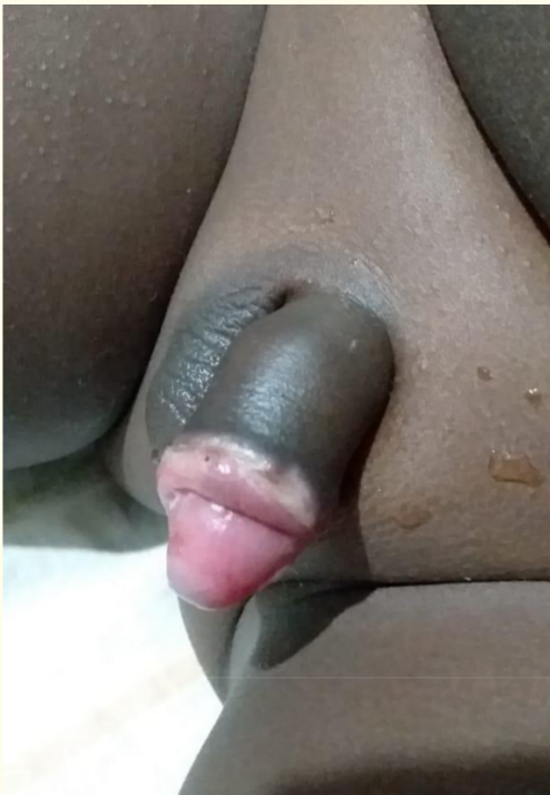
Figure 5: Showing MAOB at 1yr+ 10 months age, 1 week post-operation picture of penis and gland after Posthetomy procedure with “Postec-Inox” device.