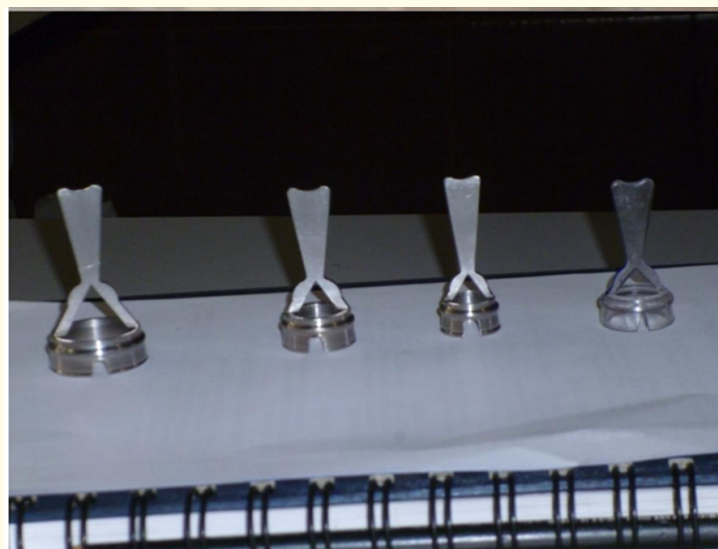
Figure 12: Postec-Inox of various sizes from 0,3 cm to 0,6 cm in vertical view.