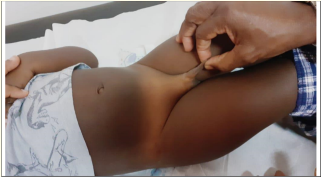
Figure 2: Showing MAOB at 1yr+ 10 months age, pre-operation picture of penis with prepuce stretched to cover urethral orifice.