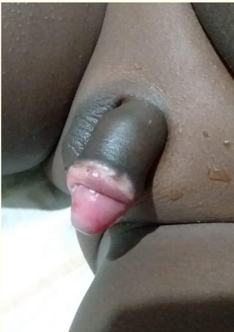
Figure 6: Showing MAOB at 1yr+ 10 months age, 1 week post-operation picture of penis and gland after posthetomy procedure with “Postec-Inox” device.