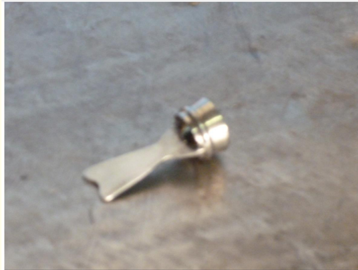
Figure 11: Postec-Inox of 0,5 cm wide internal ring in horizontal view.