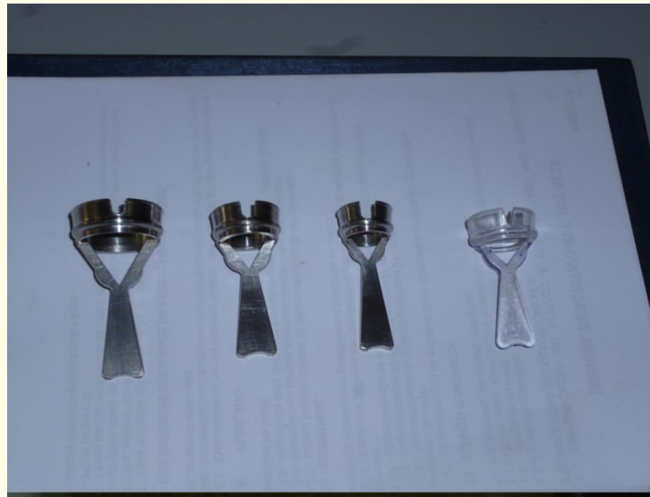
Figure 9: Various sizes of Postec-Inox from 0,3 cm to 0,6 cm wide internal rings in horizontal view.