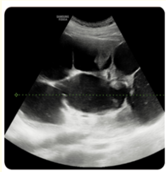
Image 1: Ultrasound showed very dilated left pelvicaliceal structures with parenchyma thinning and no ureteral dilatation.

A 13 year-old girl came to the emergency department due to abdominal and left lumbar pain. She had no previous studies and refers worsening lumbar pain during the last 5 days. Ultrasound showed very dilated left pelvicaliceal structures with parenchyma thinning and no ureteral dilatation (Image 1).