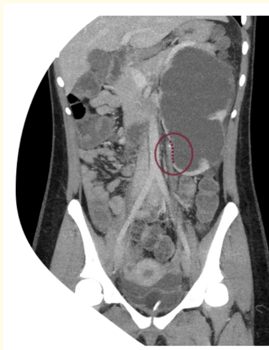
Image 2: Angio-magnetic resonance (MR) was performed to rule out the presence of a polar vessel, verifying previous findings.

Renogram with MAG-3 proved 40% differential renal function and obstructive elimination curve with retention of contrast in all caliceal structures. An angio-magnetic resonance (MR) was performed to rule out the presence of a polar vessel, verifying previous findings (Image 2).