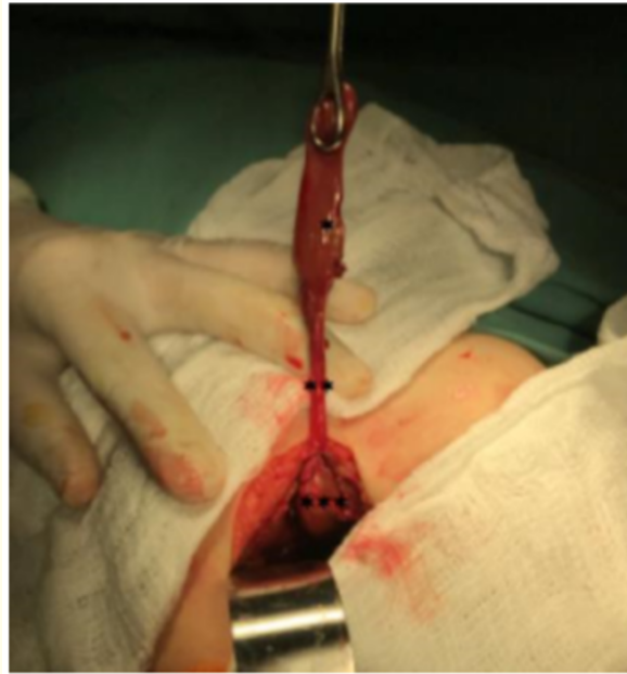
Figure 4: Deep cystic gallbladder dissection (*) with long cystic duct (**) and the appearance of cystic formation inside the cavity (***).