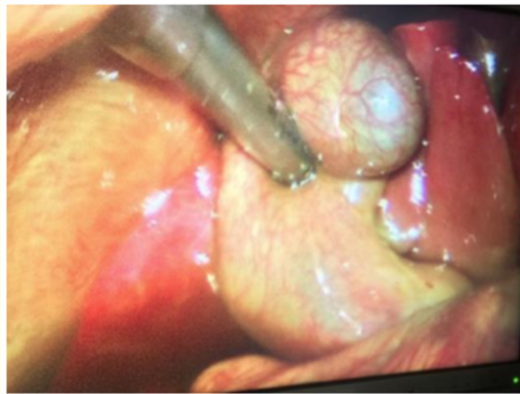
Figure 2: Video laparoscopy, with a large amount of fibrin on the bile duct.