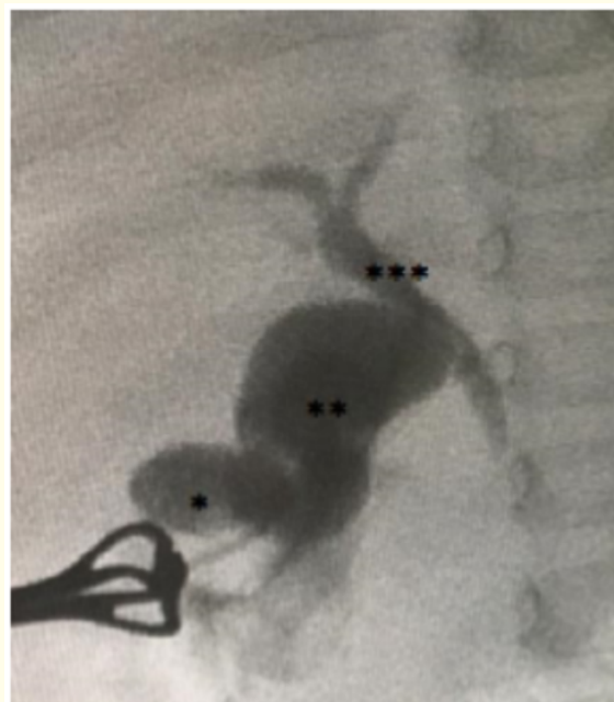
Figure 3: Intraoperative cholangiography showing the gallbladder (*), the cystic duct cyst (**), and the bile duct.