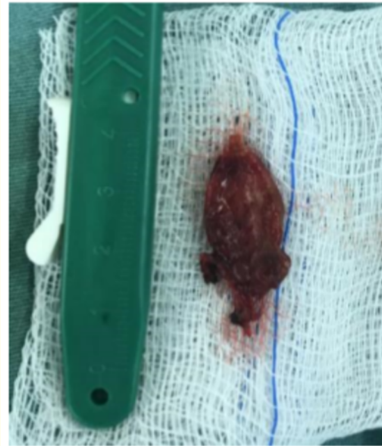
Figure 6: Cystic duct cyst.

A cholecystectomy, including the cystic duct cyst, was performed (Figure 6) with the closure of common hepatic duct perforation. We drain the abdominal cavity with a tubule-laminar drain, and a Kehr drain in the choledochal duct. The post-operative was uneventful, with hospital discharge on the 10 th postoperative day with the Kehr drain closed. At follow-up, we withdrew the Kehr drain at the 24 th postoperative day, with the patient asymptomatic.