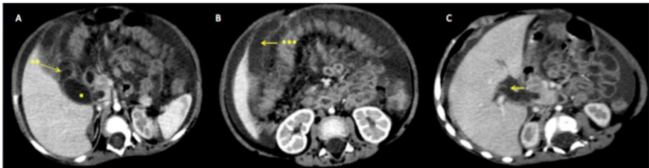
Figure 1: A: CT scan with cystic duct cyst (*) and cystic duct (**); B: gallbladder (***) ; C: common duct perforation (arrow sign).

We perform a diagnostic video laparoscopy and found a considerable quantity of free bile in the cavity, fibrin near the choledochus and an extensive inflammatory process over the bile ducts (Figure 2), opted for conversion to open laparotomy. We found a cystic duct cyst and perform an intra-operative cholangiography (Figure 3).