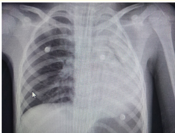
Figure 2: Chest radiograph showing left-sided opacification.

Radiographic findings are nonspecific and include atelectasis secondary to airway obstruction, hyperinflation due to air trapping, unilateral opacification, bronchiectasis and lung infiltrates (Figure 2). It has been reported that HRCT may allow in some cases the visualization of bronchial casts in the airways of larger caliber [19]. However, the gold standard in diagnosing PB is bronchoscopy which reveals the airway obstruction by BC [3].