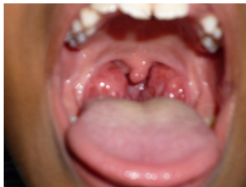
Figure 8: Above, hyperemia of oropharynx, petechiae and edema of both amygdalas and bobbled sialorrhea without aerotherapy.