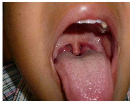
Figure 2: Above, hyperemia of oropharynx with edema of both amygdalas and bobbled sialorrhoea without aerotherapy.