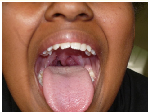
Figure 12: Below, oropharynx paleness, edema of left amygdala, mucous enanthema after aerotherapy inhalation and with \pm 7^{\circ}\text{C} of physiologic serum.