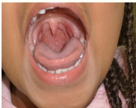
Figure 7: Below, oropharynx paleness and mucous enanthema after aerotherapy inhalation with \pm 7^{\circ}\text{C} of physiologic serum.