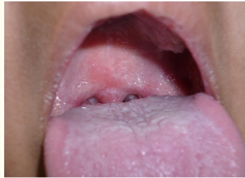
Figure 1: Above, oropharynx paleness, petechiae and edema after aerotherapy inhalation with \pm 7^{\circ}\text{C} of physiologic serum.