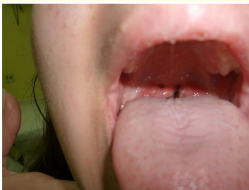
Figure 4: Below, oropharynx paleness, and edema of both amygdalas after aerotherapy inhalation with \pm 7^{\circ}\text{C} of physiologic serum.