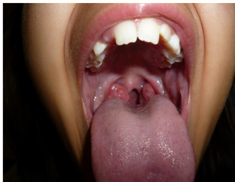
Figure 3: Below, oropharynx paleness, and edema of amygdalas after aerotherapy inhalation with \pm 7^{\circ}\text{C} of physiologic serum.