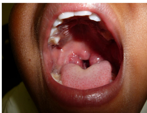
Figure 8: Above, hyperemia of oropharynx, petechiae and edema of both amygdalas and bobbled sialorrhea without aerotherapy.