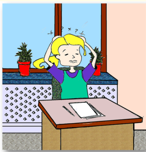
Figure 2: She realizes she doesn't understand.