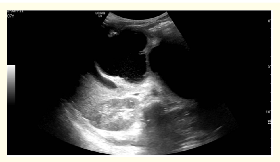
Figure 1: PPCs in abdominal ultrasound.

of 5,4 X 6 X 4,7cm and 6,7 x 6,6 x 7,5 cm respectively (Figure 1). The CT scan showed findings of chronic pancreatitis with multiple coarse calcifications of the gland and confirmed the presence of two voluminous cysts with characteristics of PPCs in close proximity (Figure 2). The patient was symptomatic with abdominal pain and symptoms of gastric outlet obstruction. Endoscopic cyst gastrostomy was decided as a treatment option for PPC drainage. The pseudocyst was identified on the posterior wall of the stomach protruding into the gastric lumen. At the end of the procedure two double pigtail biliary stents were placed which seemed adequate to ensure complete cyst drainage (Figure 3). On the 4th day postoperatively, fluid reaccumulation occurred and the endoscopy was repeated, inserting a lumen-apposing self-expandable metallic stent through the gastric-cyst communication. for pancreatic fluid cyst drainage since the other two pigtail stents have been occluded (Figure 4). Ultrasonography the 7th day post-op revealed complete resolution of both PPCs (Figure 5), proving that they were not only attached but communicating each other. The stent was removed 4 weeks later with no recurrence.