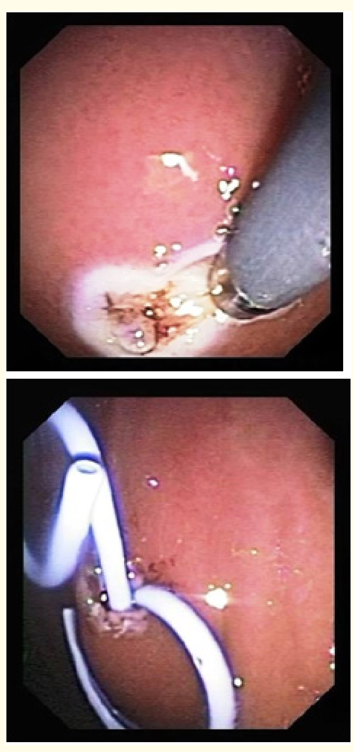
Figure 3: Double pigtail biliary stents placement.