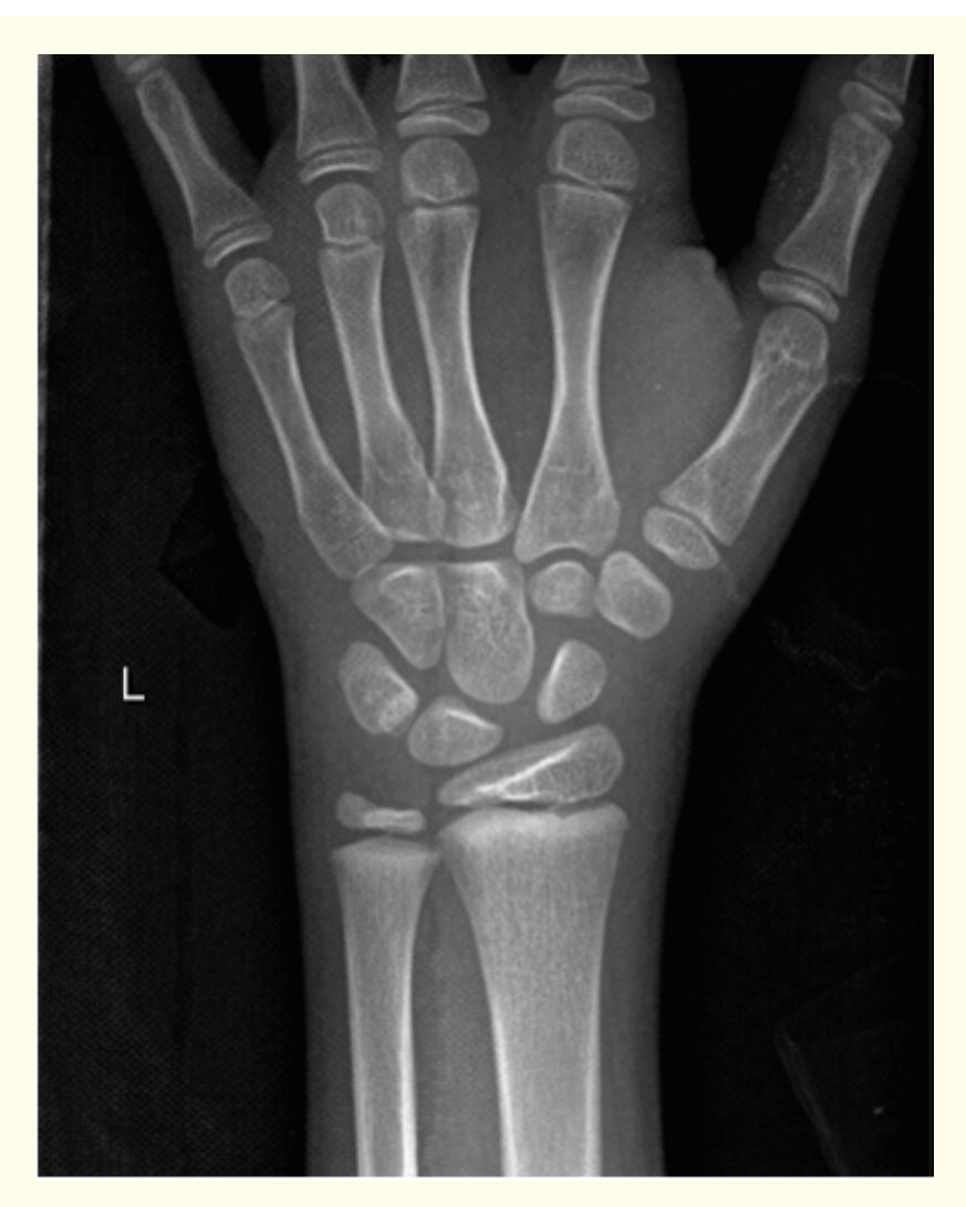
Figure 1: Bone age about 12 - 13 yrs.

Bone age was advanced: At chronological age of 7½ years, it was 12 - 13 years.