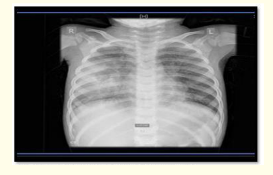
Figure 1: Large right mid zone consolidation and cavitation.

On arrival to Mafraq Hospital, the patient was found to be febrile and sick looking, although responsive, alert and hemodynamically stable. On detailed examination, the positive findings included failure to thrive, poor dental hygiene, a perforated and draining right tympanic membrane. He had right middle zone decreased air entry in the lungs with bilateral crepitation, a finding correlating to pneumonic infiltrate and cavitation on chest radiograph (Figure 1). Skin manifestation included punctate cicatricial hypopigmented macules scattered on the limbs and a small haemangioma on the scalp; there was no telangiectasia or abnormal vascular rash. Neurological examination showed wide based ataxic gait with hypotonia and hyporeflexia.