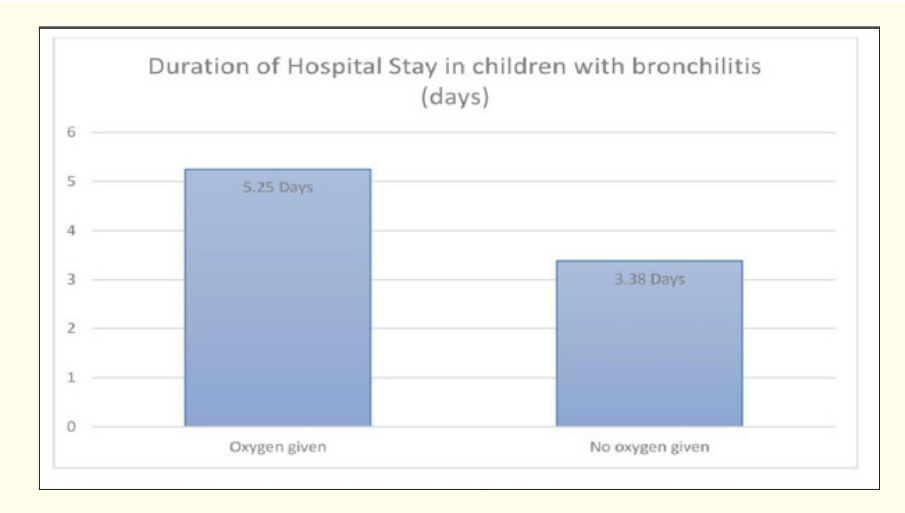
Figure 2: Duration of hospital stay for children with and without oxygen therapy given.

The children were prescribed a target \text{SpO}_2 of \geq 94\% . The mean duration of hospital stay for infants who received oxygen therapy was 5.3 days compare to 3.4 days for infants who did not receive oxygen therapy (Figure 2). For children who required oxygen supplementation, the lowest \text{SpO}_2 was 88-90% in room air (two children had lowest \text{SpO}_2 of 88%, and the other two children had lowest \text{SpO}_2 of 90%). The duration of oxygen therapy ranged from one to five days. Two children had oxygen delivered via a humidified high flow device, with a fractioned of inspired oxygen (FiO<sub>2</sub>) of 0.22 to 0.30. The other two children had oxygen delivered via nasal cannula with a flow rate of 0 - 2 L/min.