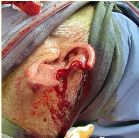
Figure 2: Radical excision of malignant tumor.