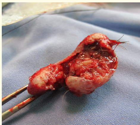
Figure 7: Three months Post-operative of reconstruction by Kummoona auricular cervical flap of the ear.