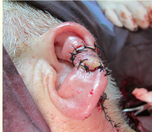
Figure 5: Flap reconstructed the helix and pre helix and posterior surface of the ear.