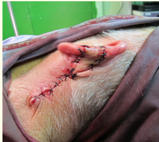
Figure 6: Specimen of malignant basal cell transformed to squamous cell carcinoma.