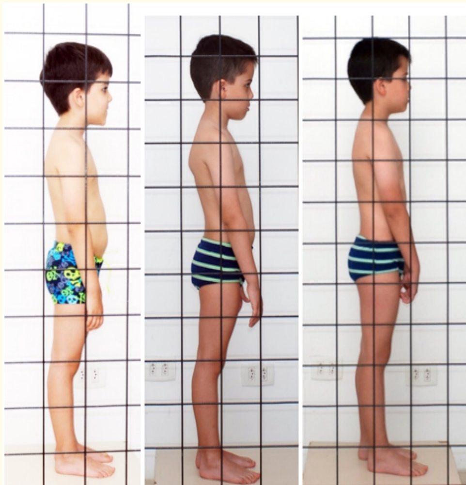
Figure 3: Effects on the body posture after using RFA III and IV.