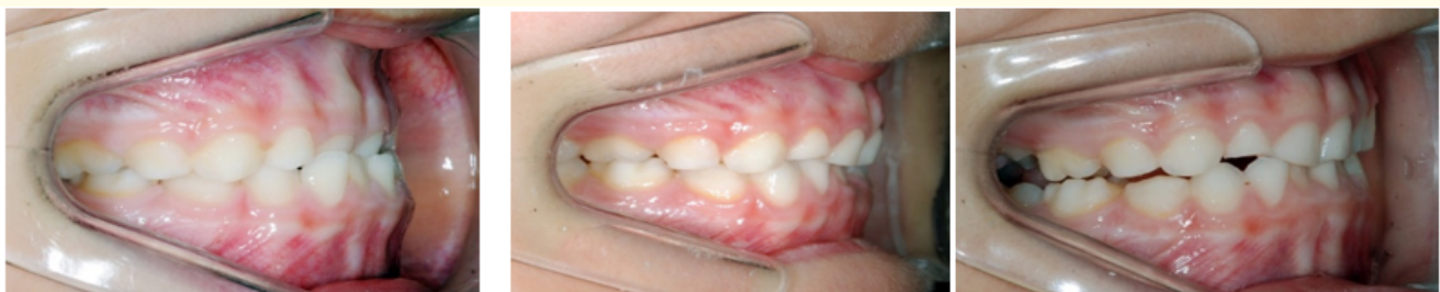
Figure 4: Occlusal alterations.