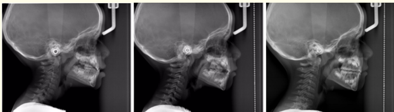
Figure 8: Cephalometric x-ray showing the improvement on the head posture from the beginning of the treatment to 1 year and 9 months of using Aragão Function Regulators III and IV.