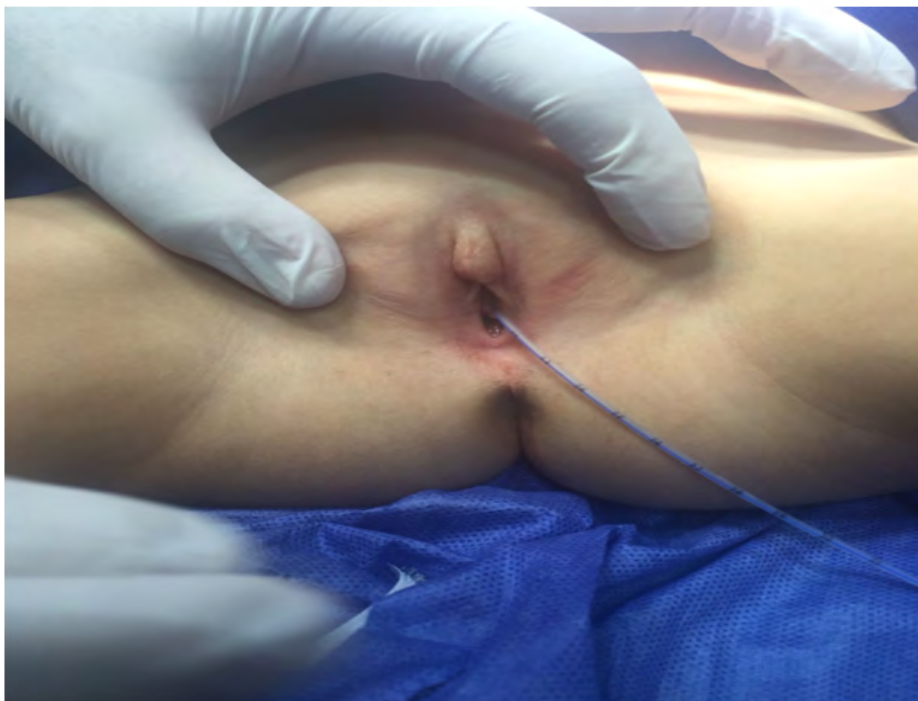
Figure 2: 5F feeding tube lodged at the catheter level of 21 cm.