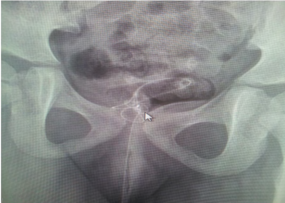
Figure 1: Radiograph showing the knotted catheter in the bladder (Arrow: the knot).