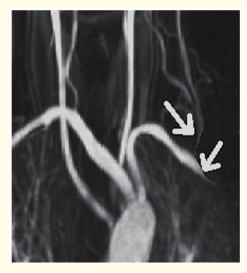
Figure 2: Angiogram showed stenotic area in left vertebral artery and left subclavian artery.