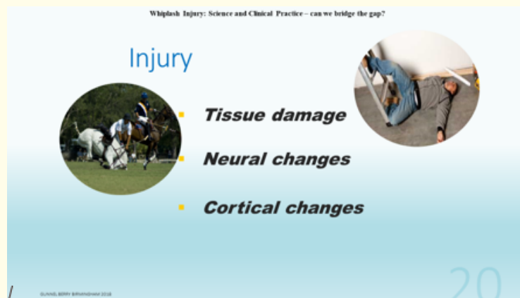
Figure 1: Injury: Tissue damage, Neural damage, Cortical damage.

Tissue damage (Figure 2) occurs when soft tissue, muscular or bone tissue reacts violently to a sudden deceleration action where a blow may cause a bone fracture, tissue bruising and minor nerve damage. A direct blow to tissues may cause internal or external bleeding, compromised nerve endings with axon exudate flowing into the tissue matrix causing compromised responses in the nerve conduction influencing immune responses with hormones producing abnormal output of adrenaline etc. to overcome painful experiences. The body builds up a physiological response to injury which ultimately affects mood and the ability to move around (as it hurts too much to move). Exudate collects in the tissue matrix causing swelling and pressure in tissues which cause more pain. Joints become stiff and unyielding which adds to functional disability and physical deterioration. Symptoms appear over time which are not immediately associated with the original injury. Symptoms and injury may be so disparate in time that they are not considered to be related at all. AdRx considers these options in the clinical reasoning for ongoing symptoms.