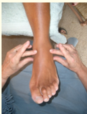
Figure 6: (L) foot. '4-point-linking' across the crural joint pressing on symphysis pubis, sacro-iliac joint, hip joint and sacrum.