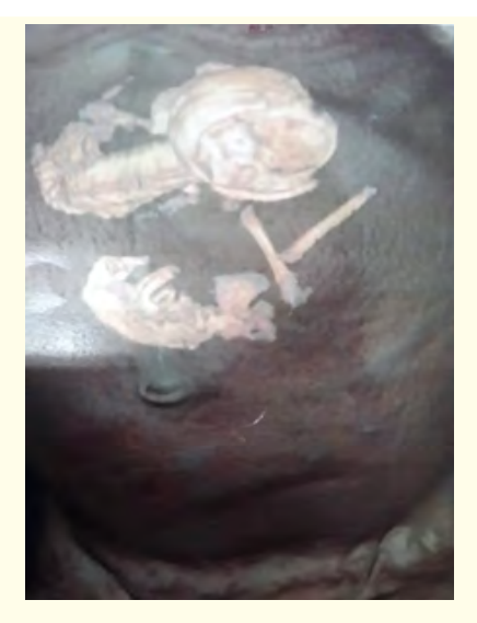
Figure 2: Contrast MDCT showing two fetal skeletons within upper peritoneal cavity.