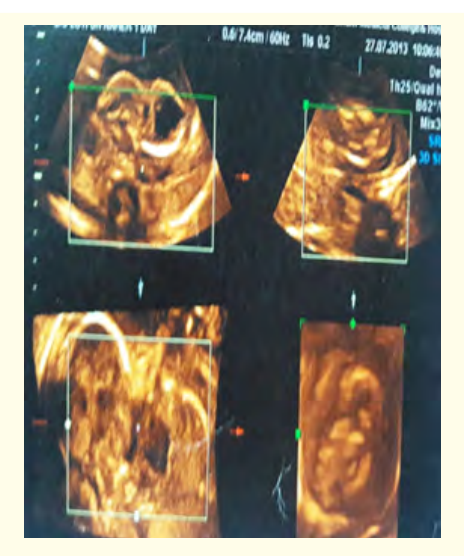
Figure 4: USG of whole abdomen showing incomplete spine along the right abdomen, lobulated clear cystic area is seen in left hypochondrium, fetal hearts could not be seen, bowel loops and intestinal loops are compressed posteriorly.