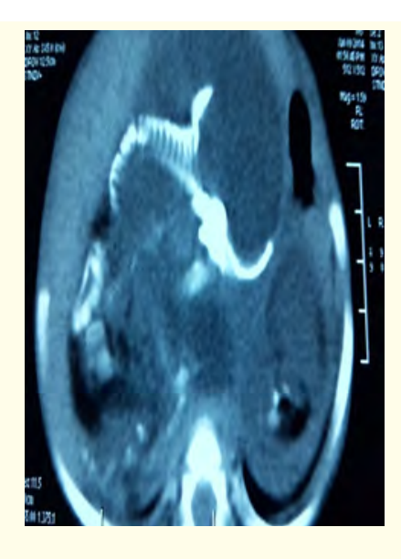
Figure 1: CT scan showing the spine of fetus.

Our patient recovered well after surgery. He was discharged home on 8<sup>th</sup> postoperative day. To rule out any recurrence the child was followed up through clinical examination, abdominal ultrasound and serum alpha fetoprotein. After two and half year, no recurrence of previous symptoms.