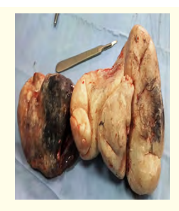
Figure 10: Specimen of the fetuses.