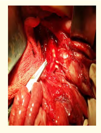
Figure 8: Ligation of blood vessel pedicle.