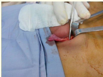
Figure 3: Intra operative view of undescended testis.