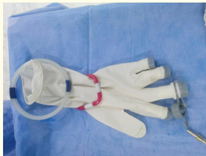
Figure 1: Glove port ready for insertion.

We started intervention by glove preparation which consisted in the insertion of two 3-mm and one 5-mm trocars through the fingers of the glove by cutting the tips. A flexible ring was passed through the open end of the glove and turned around it [figure 1].