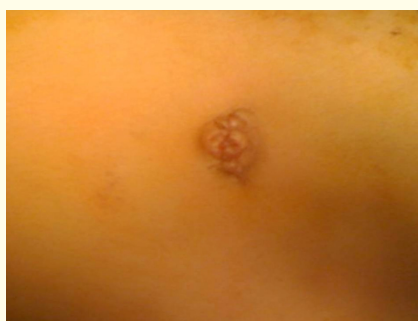
Figure 4: Postoperative photograph showing umbilical incision.

A total of 20 boys LESS orchidopexy were performed in our department. Their age ranged from 9 months to 24 months (mean age: 18 months). All patients had non palpable unilateral undescended testis, which was in the right side in 14 patients and left side in six patients. Seventeen patients had laparoscopic orchidopexy without vessel division as a one-stage procedure and 3 patients had LESS Fowler-Stephens orchidopexy for the first and the second stage. LESS orchidopexy was possible in all selected cases without conversion. Average operating time was 57 minutes, with extremes ranging from 40 to 80 minutes. The mean operative time for those undergoing one-stage orchidopexy was 57.11minutes, extremes ranging from 40 to 80 minutes, 24 minutes for primary FS (ranging from 20 to 26 minutes) and 56.66 minutes for second stage (ranging from 56 to 58 minutes). Neither intra nor postoperative complications were seen and the patients were discharged within a few hours of surgery. No patients were lost to follow-up. The total duration of the follow-up period ranged from 3 months to 1 year 6 months where one patient had atrophy, after FS procedure, and two cases had re-ascent of the testicle. There was no score done to evaluate the final scar. But umbilical incision was nearly invisible and much appreciated by the parents. There were no signs of umbilical hernia [Figure 4].