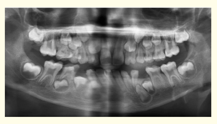
Figure 3: Orthopantamograph showing gemination of maxillary primary central and lateral incisors on right and left side along with Talon cusp on maxillary permanent left lateral incisor, agenesis of mandibular left second premolar as well as taurodontism of first permanent molars of maxilla and mandible.