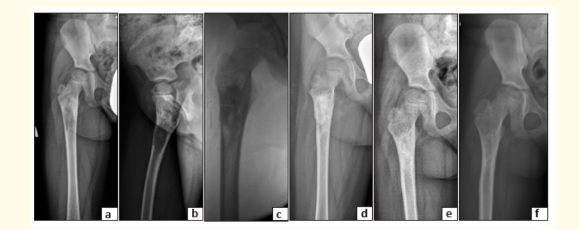
Figure 1: Radiographs of patient V: a, b) at the time of hospitalization; c) after surgery and filling the bone defect with an allo-implant; d) in 6 months; e) after 12 months; f) after 15 months.

Its mode was determined by the results of control radiographs. After 12 months. after surgery, radiographs revealed signs of almost complete reconstruction of the implant material in the area of the tibial defect (Figure 1e), after 15 months signs of complete reconstruction of bone material in the area of implantation (Figure 1f).