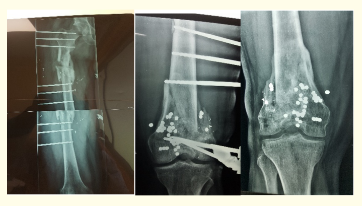
Figure 2: Consolidated of the midshaft and distal third of the femur.

Other complications were delayed union 10 (11.6%), non-union 7 (8.1%), malunion 9 (10.5%), secondary fracture displacement 3 (3.5%), chronic bone infection 3 (3.5%) and decreased range of motion of the knee 23 (26.7%).