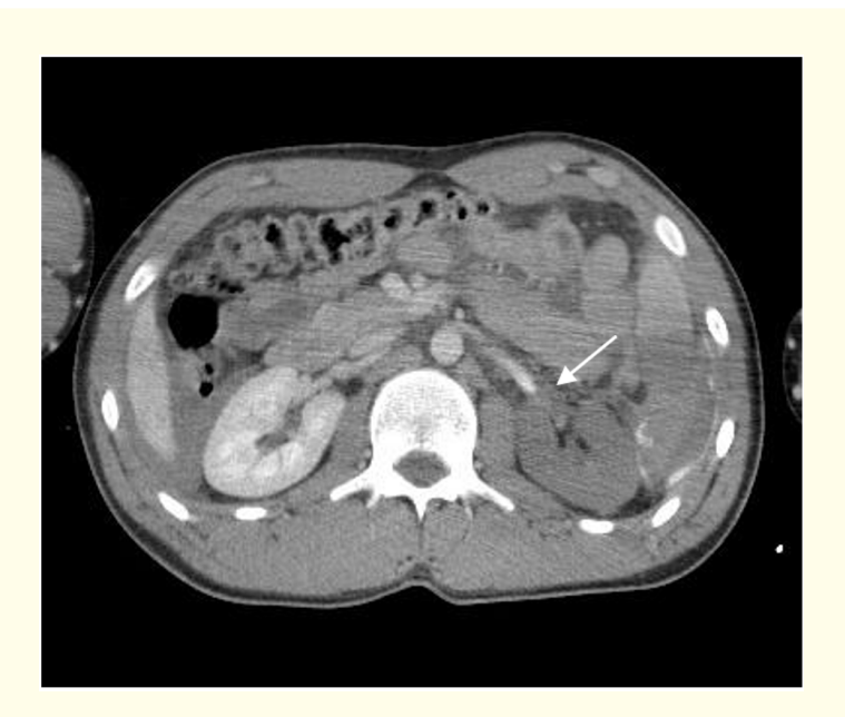
Figure 2: The left renal artery with abrupt stop before the left kidney.

FAST ultrasound queried a laceration to the spleen, but no free fluid in the Koller or Morrison pouches or the abdomen.