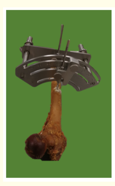
Figure 1: Application of rotational goniometer to control the rotational angle after osteotomy.