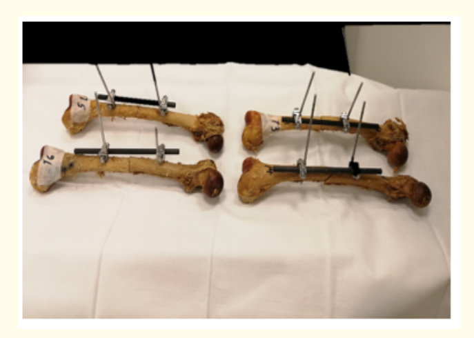
Figure 2: Scanning of the femora using CT.