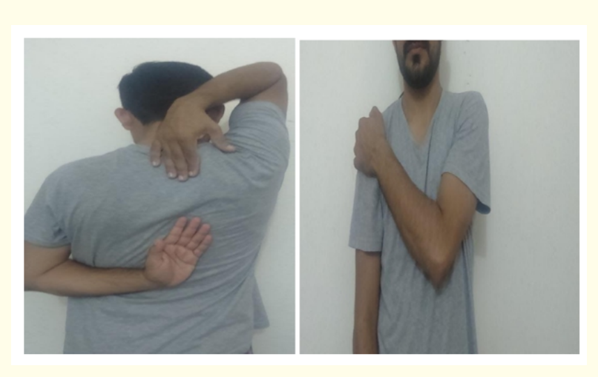
Figure 1: Scratch test for assessment of shoulder joint range of motion.