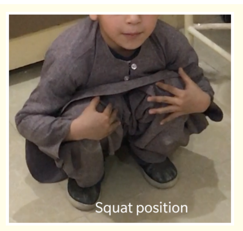
Figure 1b: Squat position.