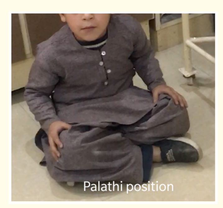
Figure 1c: Palathi position.