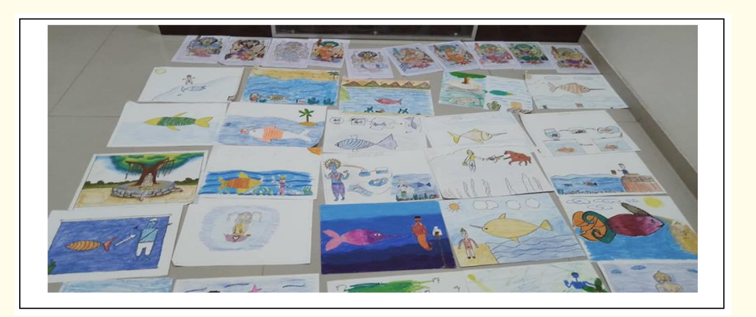
Figure 5: Mythology Colouring with imagination of the stories.