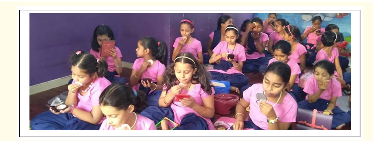
Figure 4: Dance make-up learning.