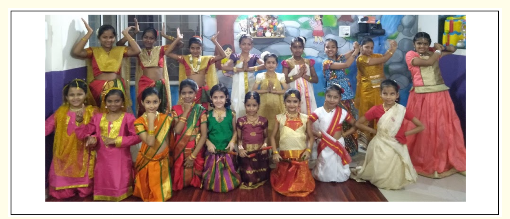
Figure 3: Exploring folk dances of India.

Methodology is the basis of all basics of dance, positioning the body correctly while performing, and proficiency in performing. A focused system of learning across varied areas of dance makes it aesthetically beautiful and safe.