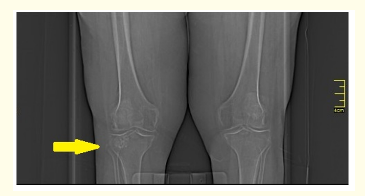
Figure 1: Topogram showing intra-osseous tumor (yellow arrow) on the right tibial plateau.

The computerized axial tomography (TAC2 2291/19) detected osteoblastic imaging at the level of the right tibial plateau that does not break the cortex, with well-defined contours, with dimensions of 2.59 by 2.46 centimeters. In addition, multiple subchondral cysts with a degenerative appearance, presence of tibial osteophytes, ipsi and contralateral femoral bones, a very diminished femoro-patellar space associated with sclerosis of the femoral condyle were observed (Figures 1 and 2).