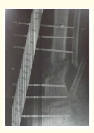
Figure 2A: Open fracture type III B of Gustilo treated with FESSA.