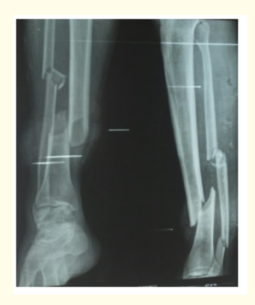
Figure 3A: X-ray right leg F/P.