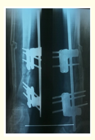
Figure 3D: Septic pseudarthrosis.