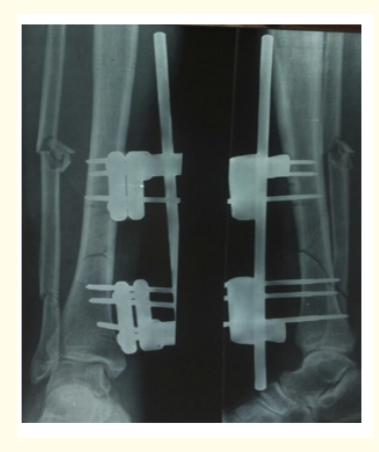
Figure 3B: Fracture treated with Hoffmann type external fixator.