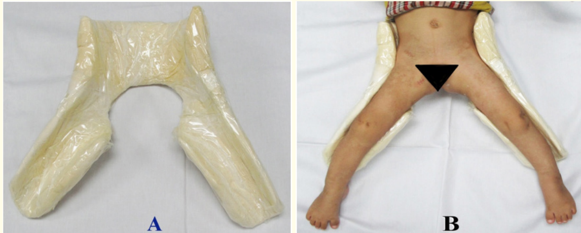
Figures 2A and 2B: A: The haft spica cast; B: The patient is gradually weaned from the brace to wear haft spica cast it only at night.

Three months after surgery, the entire cast is removed, and Patients is gradually weaned haft spica cast it only at night and nap time until acetabular development is normal. The haft spica cast (Figure 2) is usually worn for an average of 12 to 24 months after surgery.