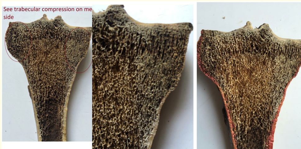
Figure 4: Trabecular compression causing medial collapse and OA in varus knees.