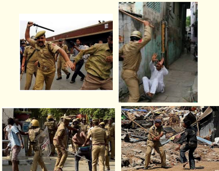
Figure 3: Patterns of police violence causing fibular fractures.