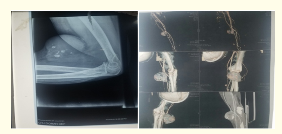
Preoperative X ray

The patient is currently being followed in oncology.