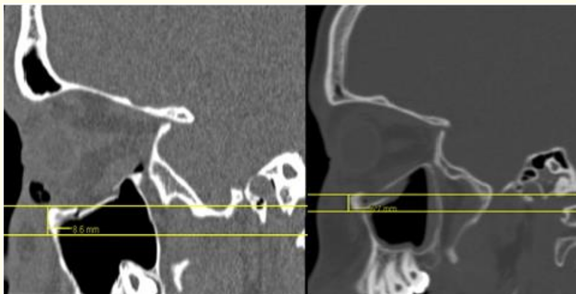
Figure 2: Measurement of lower orbital rim thickness in a young adult and an elderly.