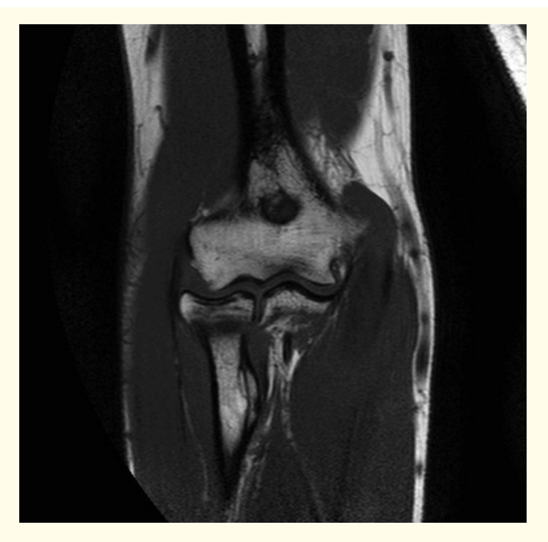
Figure 2: MRI confirming the diagnosis of non-union at 3 months.

At six months post injury the patient was asymptomatic and a subsequent x-ray follow-up revealed union of the fracture (Figure 3). The patient remained symptom free with full range of motion at the elbow.