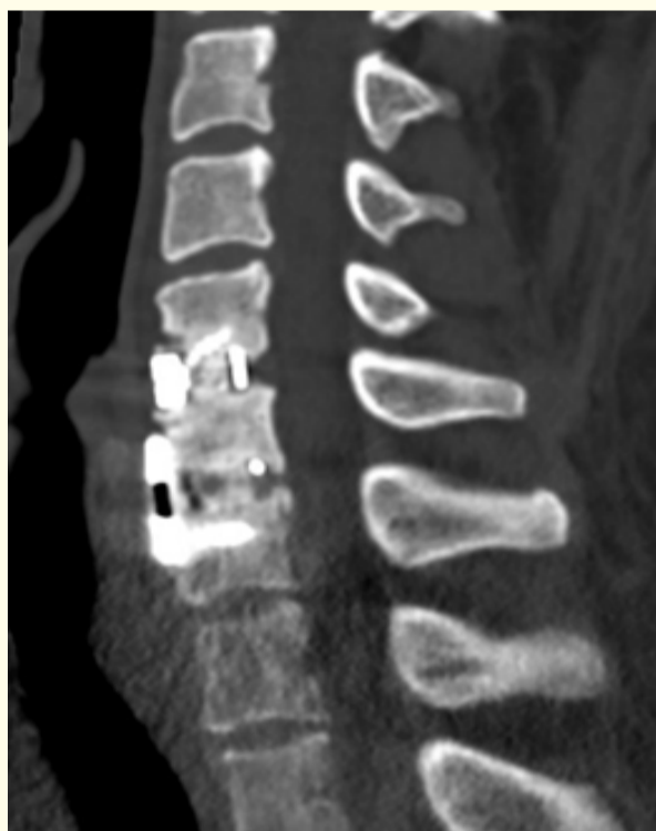
Image 4: [Sagittal C5-6 ACDF w/ Fibergraft – Prior C6-7 ACDF w/o Fibergraft].

Image 4 shows a CT scan of a C5-6 ACDF grafted with Fibergraft BG Morsels at 4-months post-operation. This subject had undergone a previous ACDF at C6-7 without the use of Fibergraft BG Morsels. The fusion with Fibergraft BG Morsels at C5-6 appears to be more complete than the fusion at C6-7.