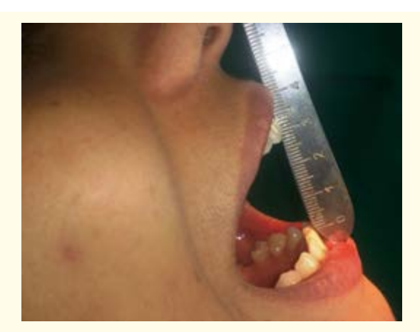
Figure 4: Post-Op Mouth Opening.

The patient was discharged on the same day after complete recovery. Post-operative healing was uneventful and post op mouth opening of 30 mm (Figure 4) was recorded Figure 2. VAS showed an immediate decrease in TMJ pain (VAS score: 1). Subsequent follow-up showed satisfactory mouth opening, no pain and no skin healing visible scar (Figure 5).