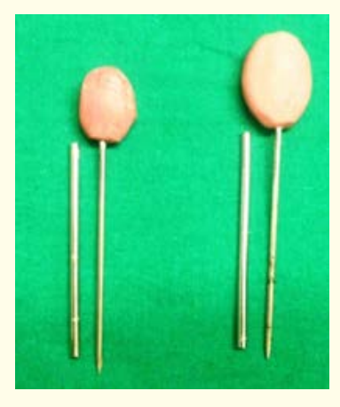
Figure 2: Indigenously Designed Custom Made Trocar.