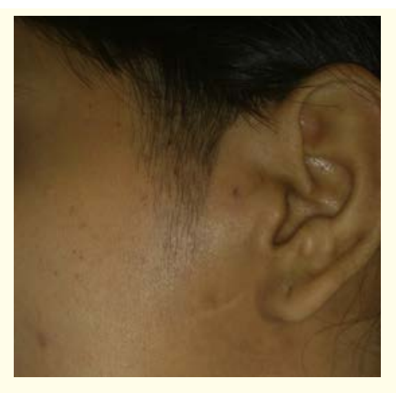
Figure 5: Post-Op Healing with no visible scar.