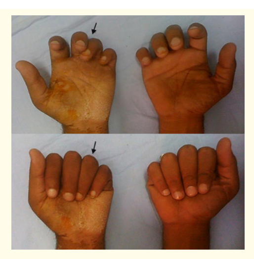
Figure 5: A. The middle finger overlaps the rotated ring finger(arrow) on flexion of the fingers of the left hand. B. Same patient was able to fully flex the rotated finger showing no stiffness of the affected left hand.

Complications varied from minor ones as infection and loosening of wires with no consequences on the treatment outcome in 4 patients (19.04%) to major complications as deformity (Figure 5,6) and stiffness affecting the final end results in 4 patients (19.04%).