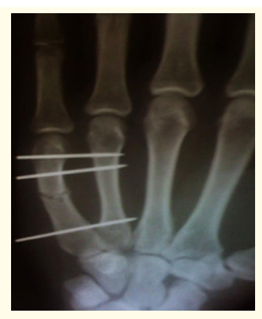
Figure 1: The most distal wire was placed through the fractured "border" metacarpal to the intact "central" one just proximal to the collateral recess of both bones and has also avoided tethering the sagittal bands.