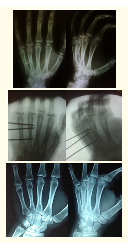
Figure 4: A 19 years old female patient presented to the emergency department with a closed spiral fracture of the lower third of the fourth metacarpal shaft of her left hand due to a twisting injury to the fourth finger.

Union was seen in all 21 patients (100%); within 6 to < 8 weeks in 10 patients (47.61%) (Figure 4), 8 to < 10 weeks in 8 patients (38.09%) and 10 to < 12 weeks in 2 patients (9.52%). Delayed union (i.e. union within more than 16 weeks) was encountered in only one patient (4.76%) with a comminuted fracture. (Table 3).