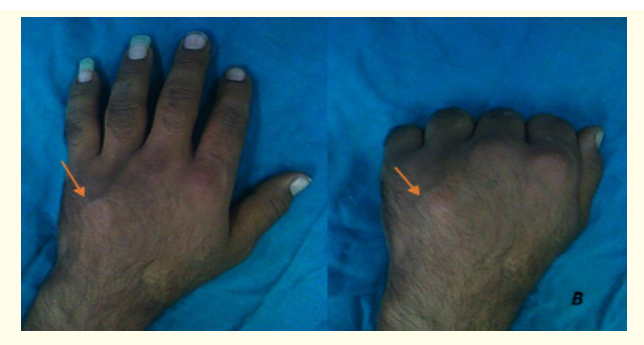
Figure 6: A. A dorsal hump (arrow) denoting a dorsal angulation of the left fourth metacarpal. B. The hump (arrow) becomes more prominent on fingers flexion.

Citation: Tarek Aly. "Management of Unstable Metacarpal Fractures with Traversing Kirschner Wiring". EC Orthopaedics 6.1 (2017): 32-39.