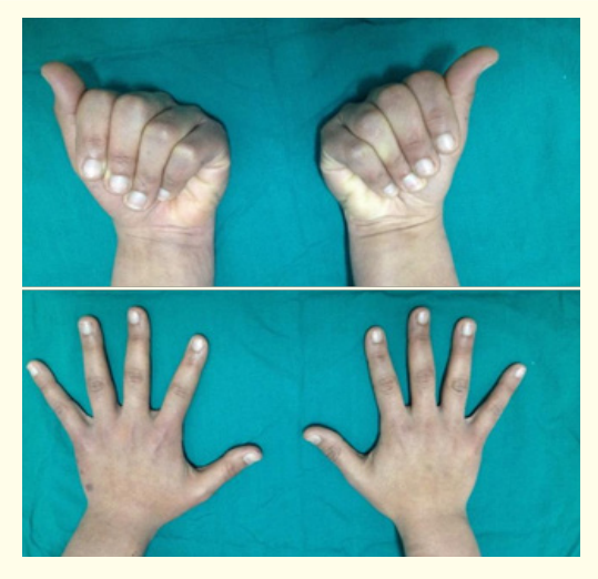
Figure 3: Excellent range of motion of fingers flexion and extension was fully restored eight weeks postoperatively.

According to the system adopted by the American Society for Surgery of the Hand (ASSH) Total Active Movements score (5), there were 13 patients (61.90%) who ended up with excellent results (Figure 3), 6 patients (28.57%) with fair results, and 2 patients (9.52%) with poor results (Table 1).